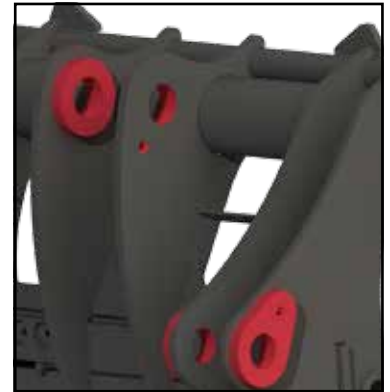
Machine pin-on hook-up of Combo Coupler.

Make your attachments work for your machine with the Craig Combo Coupler. Easily adapt your new machine to work with the OEM hooks on your existing fleet of attachments. The Craig Combo Coupler offers minimal extension to the loader's arms and is available for a wide variety of OEM hook-up configurations.