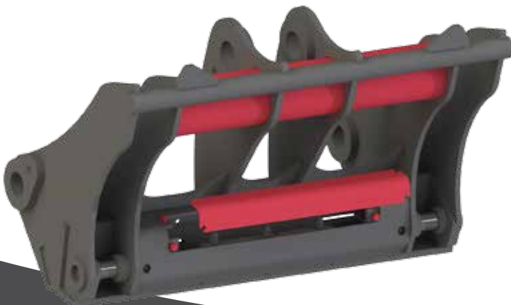
A large centrally located tube is the backbone of the Combo Coupler's durable design. The hydraulic cylinder is protected by a cover to prevent debris from damaging the cylinder.

Each Combo Coupler is custom designed for the specific application it will be working in. The base coupler features a rugged tube construction design with a protected cylinder to prevent damage from debris. In some cases, reinforcing and different material types are used in the coupler to suit the application it will be used in.